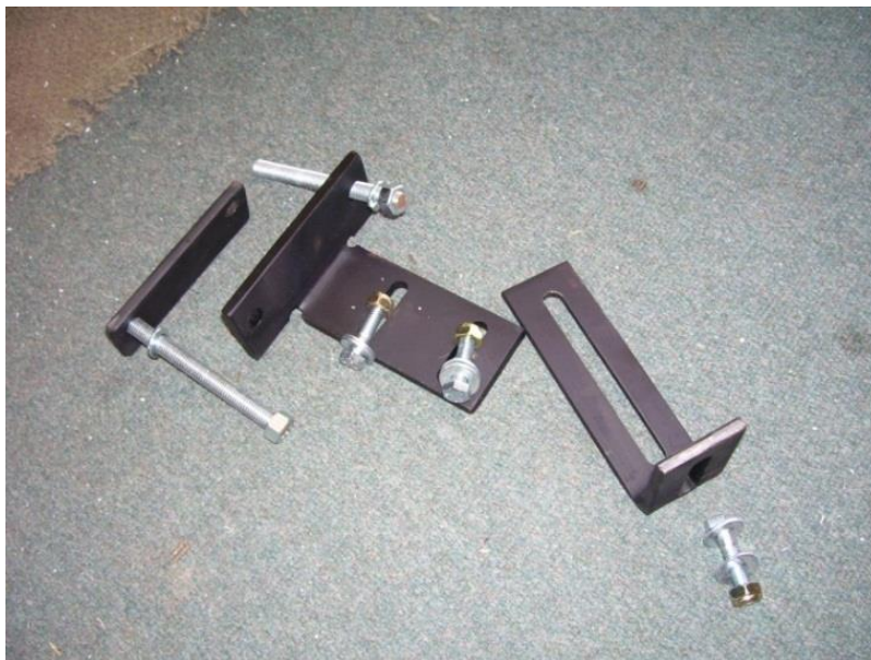
Middle & Back bracket driver and passenger side

NOTE: Threaded side of back plate goes to the top of the bracket